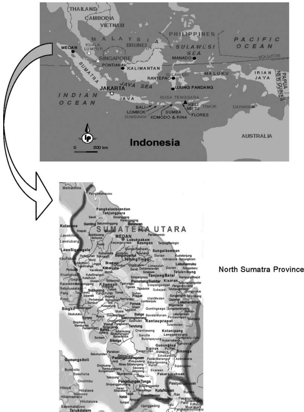
Figure 1. North Sumatra Province, Indonesia.

documented. This article presents data collected from focus group discussions (FGDs) conducted to gather information regarding the practice and cultural beliefs related to consumption of torbangun as a lactagogue during the early lactation period.