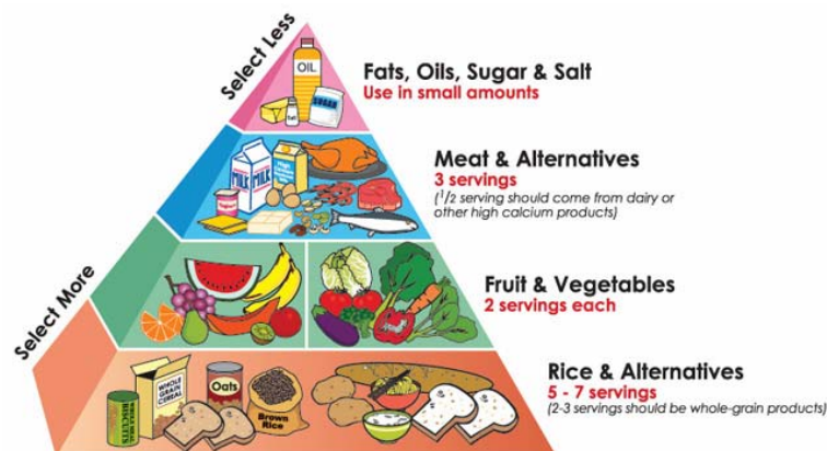
Figure 2. Singapore’s Healthy Diet Pyramid (2009)

HPB is in the process of developing guidelines for food advertising targeted at children. One proposal is that food products that run counter to the dietary guidelines ethos